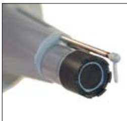
Probe guard protects sensing element.