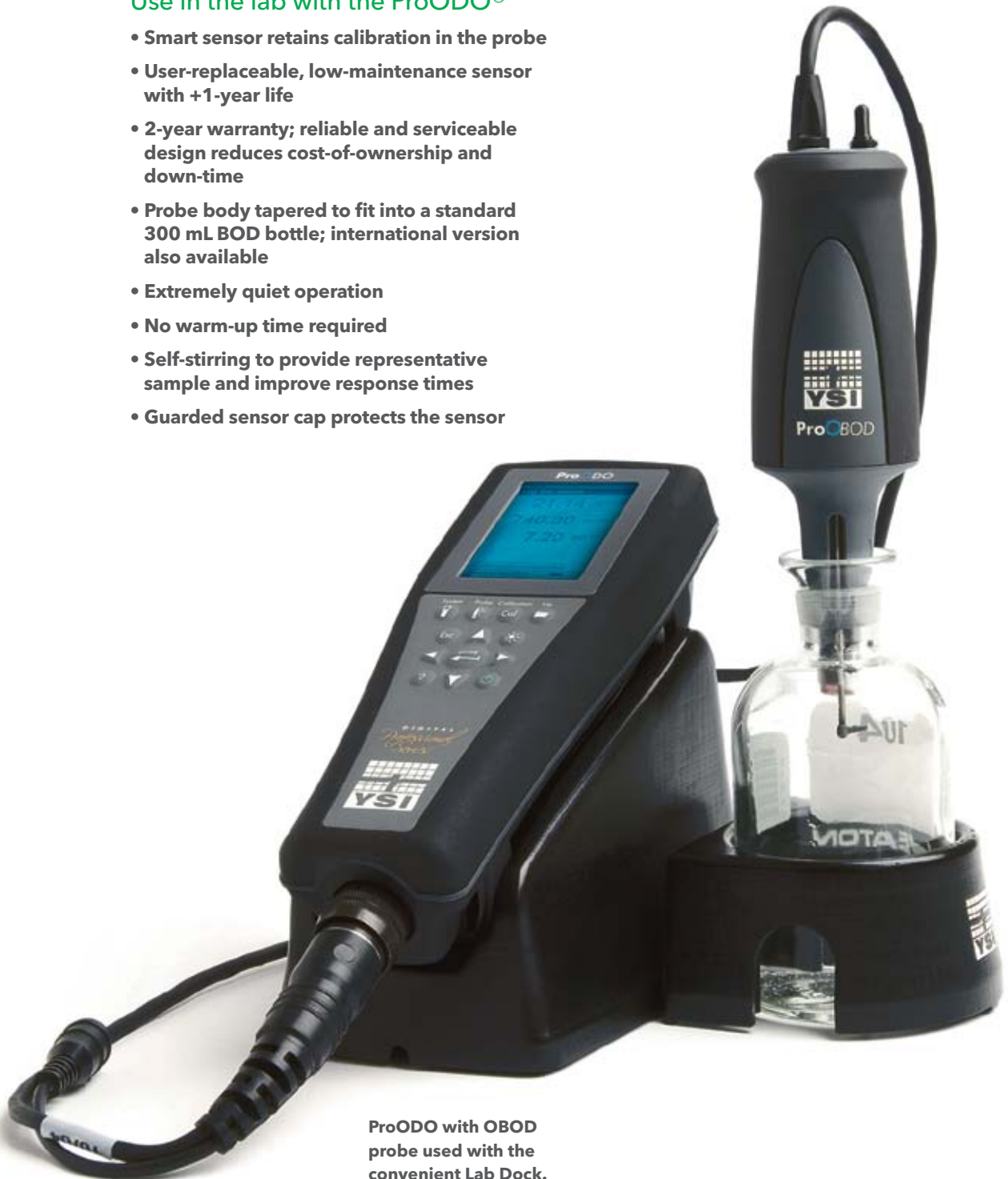
ProODO with OBOD probe used with the convenient Lab Dock.