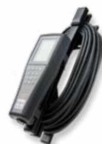
603062 cable management kit

* special order cables up to 100-meters in 10-meter increments