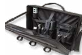
603075 soft-sided carrying case with ProODO, cable, and accessories