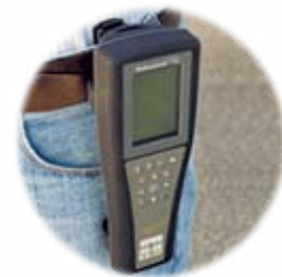
603069 belt clip